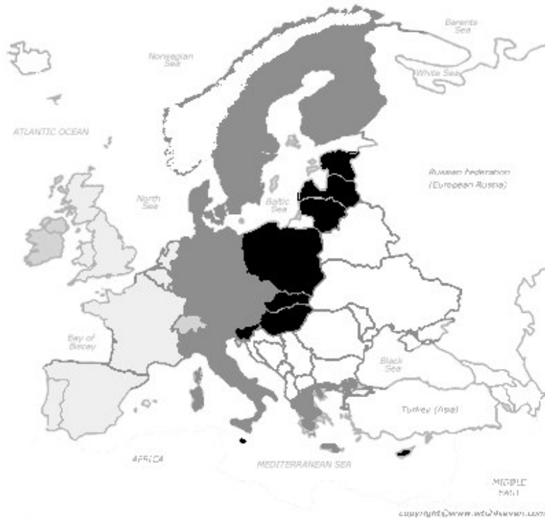
Figure 3: Map of EU25

Note: black area = new member states (NMS), grey area= neighbors of NMS, light grey area = non-neighbors of NMS